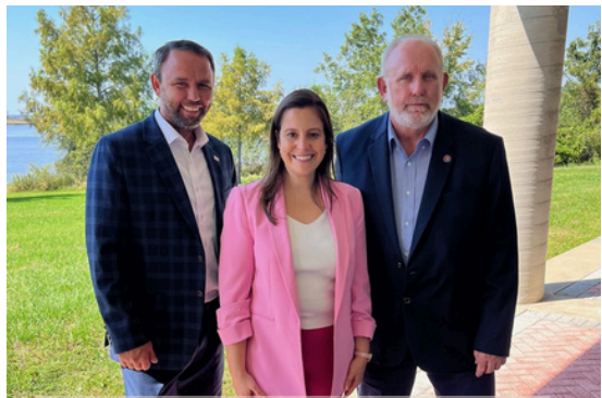
Jackson County Republican Women Founders Day Event, Moss Point October 8th