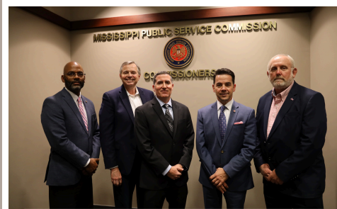
MPSC Nuclear Summit snaps with presenters from Tennessee Valley Authority and Grand Gulf Nuclear Station