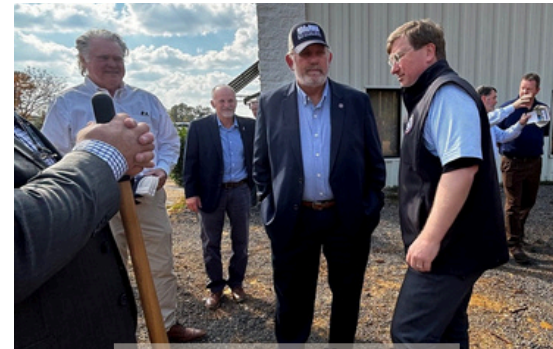
MsRWA Groundbreaking Ceremony, Pearl, MS October 29