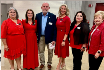
Smith County Republican Women Charter Dinner, Raleigh October 14