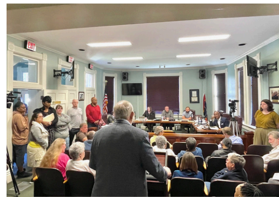
Adams County Board of Supervisors, Natchez, MS October 21