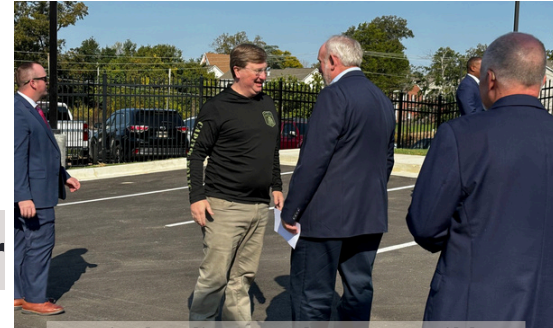
Capitol Police Headquarters Ribbon Cutting, Jackson, MS October 15