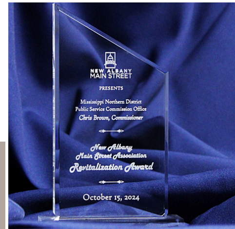
Revitalization Award received at the New Albany Main Street Annual Meeting