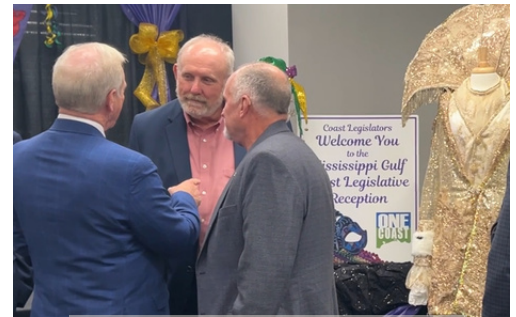
Gulf Coast Legislative Reception