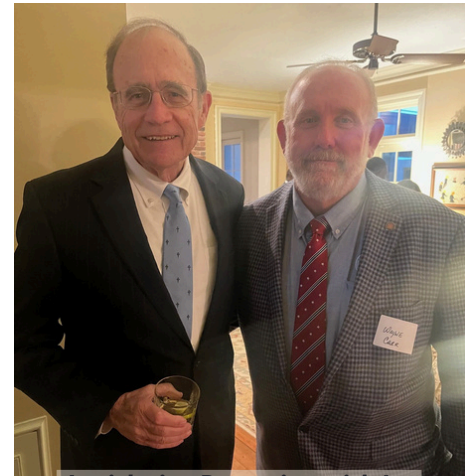
Legislative Reception with Lt. Governor Hosemann