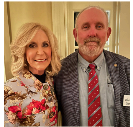
Legislative Reception with Attorney General Fitch